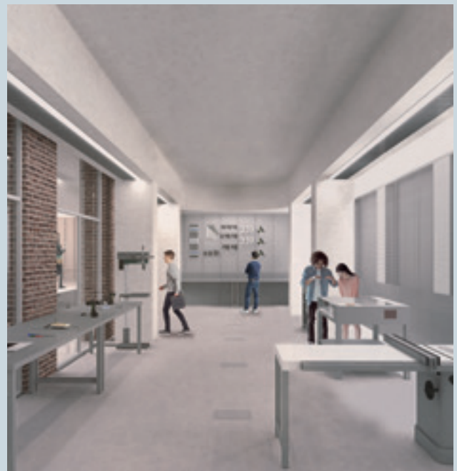
Artist's impression of how a maker space may look.

Philanthropy has also provided vital cutting-edge equipment for the new Centre for Engineering a Sustainable Future. Sustainability is the golden thread running through King's engineering research, and we're excited about how these research activities will make people's lives greener, easier and safer – for example, by scaling food protein technology to help feed the world. Your support is accelerating the research programmes that could transform the most pressing sustainability challenges facing global communities.